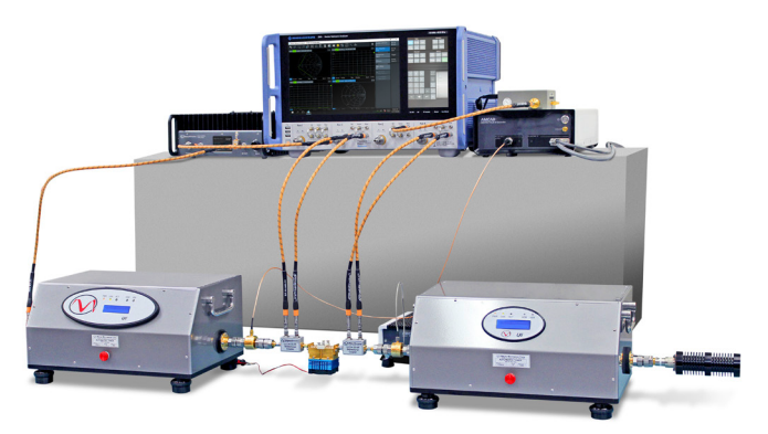
Vector-receiver load pull application

Load pull is a powerful method for characterizing RF power amplifiers through impedance variation. Load pull enables model extraction and validation as well as performance, ruggedness and efficiency testing.