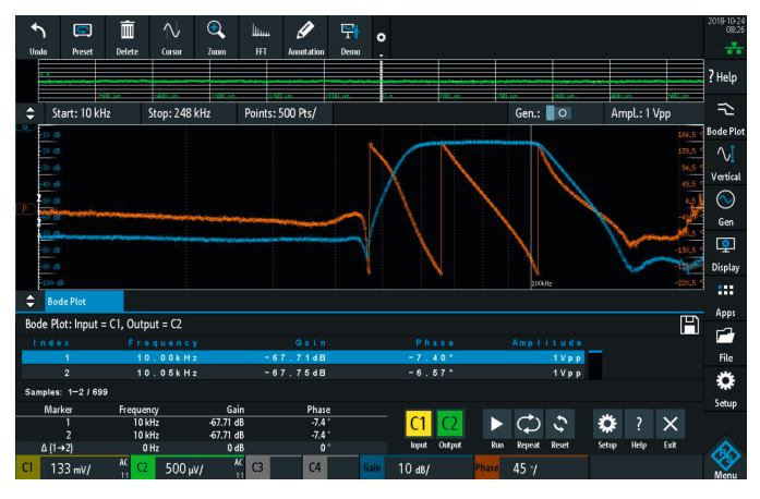
Frequency response of a bandpass filter (blue trace: gain; orange trace: phase)

Engineers use oscilloscopes as a primary measurement tool. Equip your oscilloscope with a Bode analysis option to determine the frequency response of passive components. The R&S®RTx-K36 frequency response analysis (Bode plot) option for the R&S®RTB2000, R&S®RTM3000 and R&S®RTA4000 oscilloscopes provides a low-cost alternative to low frequency network analyzers or dedicated standalone frequency analyzers. With their 10-bit ADC, low noise and 25 MHz generator, the R&S®RTB2000, R&S®RTM3000 and R&S®RTA4000 oscilloscopes ideally meet the high dynamic range requirements of this measurement task.