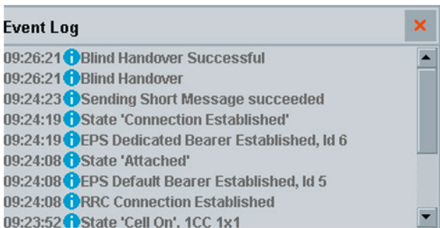
Tracing steps for blind handover.