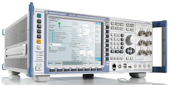
R&S®CMW500 wideband radio communication tester.

Rohde & Schwarz offers a one-box solution for testing intra-RAT and inter-RAT handover: the R&S®CMW500 wideband radio communication tester. The R&S®CMW500 can simulate end-to-end links as well as base stations for the GSM, 3G and 4G communications standards. It can test a handover within the same signaling application (e.g. LTE to LTE) or between two different signaling applications (LTE to 3G or GSM).