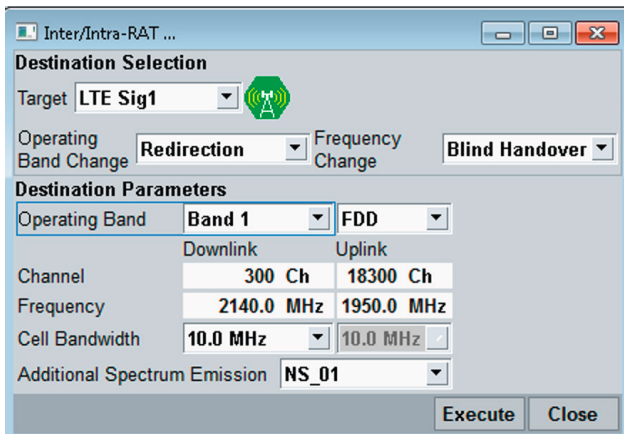
Configuring the R&S®CMW500 for handover testing.