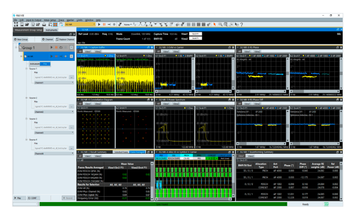
5G MIMO analysis using R&S®VSE