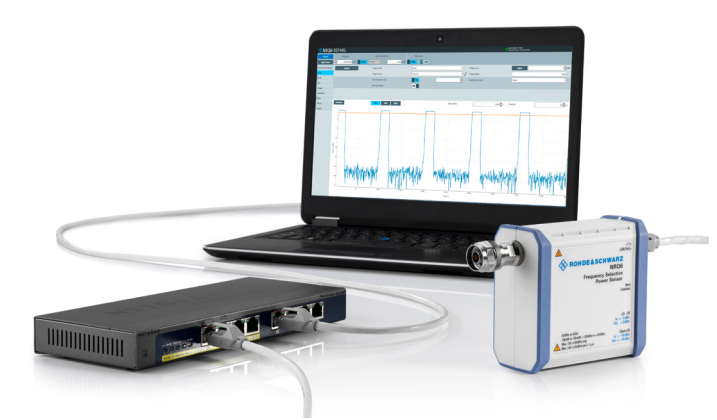
R&S®NRQ6 frequency selective power sensor