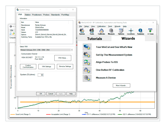
R&S®ZNA43 selected as VNA in FormFactor WinCal XE software.

On-wafer RF test setups cannot rely on the coaxial or waveguide calibration methods and standards typically used with VNAs. To enable accurate and consistent calibration results at the wafer level, you must use probe-tip calibration techniques performed on calibration substrates. These substrates include lumped-element impedance standards, calibration and verification lines, probe alignment marks, as well as an area for probe planarization.