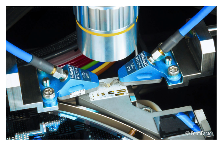
FormFactor InfinityXT RF probes contacting a standard on a calibration substrate.

Continuous wave (CW) signals are typically used to verify RF characteristics. Pulsed signals are also often applied when testing active devices to limit device self-heating. Thermal management is important for two reasons. First, you want to keep your DUT in stable thermal conditions to enable reliable, repeatable and controlled measurements. Second, overheating could damage or destroy your DUT.