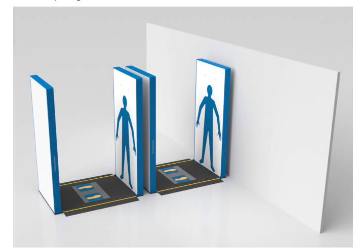
Visit the R&S®QPS Learning Center at www.rohde-schwarz.com/QPS

R&S® is a registered trademark of Rohde&Schwarz GmbH&Co. KG Trade names are trademarks of the owners PD 3609.2775.92 | Version 02.00 | September 2022 (st) Simple, open design Data without tolerance limits is not binding | Subject to change © 2019 - 2022 Rohde&Schwarz GmbH&Co. KG | 81671 Munich, Germany