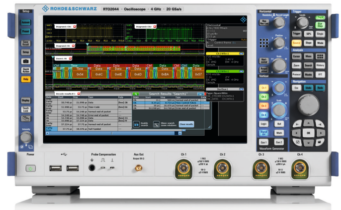
The R&S®RTO oscilloscope triggers and decodes continuous SpaceWire data streams.

The complexity and requirements of aircraft data networks (ADN) have greatly increased over the years. Starting with analog, point-to-point connected systems, there are now a number of standard buses for the avionics and aerospace industries. Some, such as ARINC 429 and MIL-STD-1553, have been around for decades. Others, such as SpaceWire, are relatively new, and still others are proprietary. The R&S®RTE and R&S®RTO oscilloscopes support all of these buses.