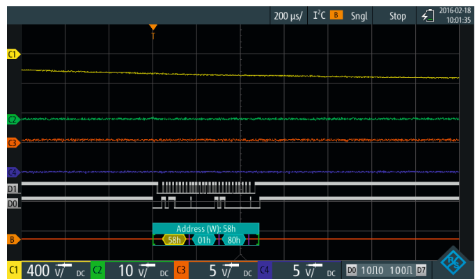
Ramp-up of an embedded AC/DC converter, programmed by PMBus/I 2 C command

(C1: 230 V AC input; C2: 12 V DC output; C3: 5 V DC output; C4: power good; D1: I 2 C_SCL; D0: I 2 C_SDA; B: I 2 C bus decoding).