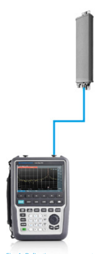
Fig. 1: Reflection measurement of a base station antenna with R&S*Cable Rider ZPH.

The R&S®Cable Rider ZPH, a simple one-port cable and antenna analyzer, can be used to swiftly and easily perform reflection measurements and other tasks. Reducing time and errors on site can save operating costs and minimize downtime.