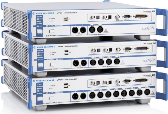
The R&S®UPP audio analyzer family

Combining the R&S®UPP audio analyzers with the R&S®SMB100A signal generators provides the most compact and fastest test solution for modern FM car radios