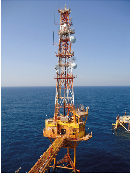
Offshore drilling rig with communications infrastructure.

The Petróleos Mexicanos (PEMEX) oil company (the largest enterprise in Mexico and Latin America) uses a communications solution from Rohde&Schwarz to coordinate transport flights between offshore drilling rigs and to manage the supply of materials and transport of passengers to the sites.