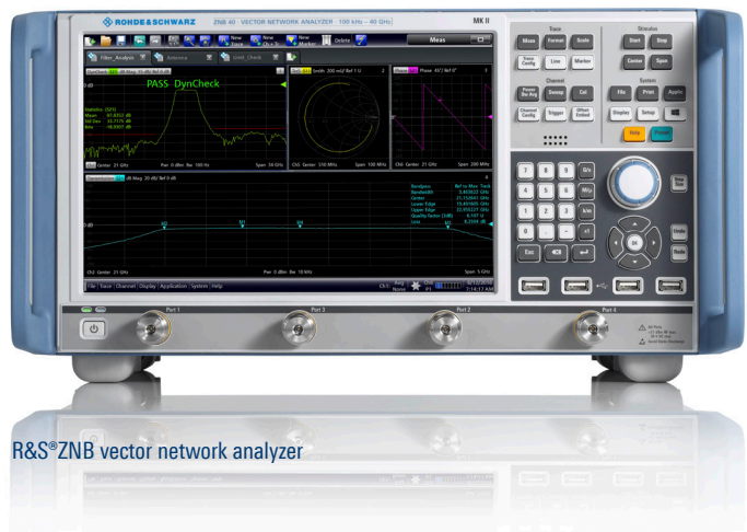
R&S®ZNB vector network analyzer

www.microcraft.jp/en/tdr/lineup/e2v6151.html