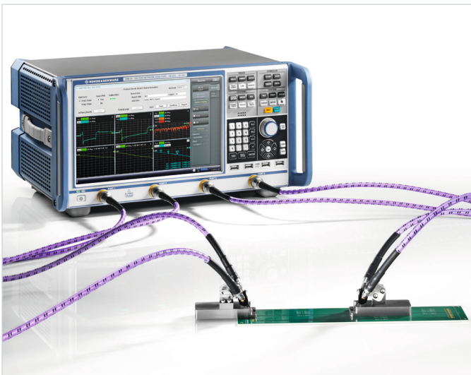
R&S®ZNB20 setup to verify the high-speed differential signal lines on a PCB up to 20 GHz

With continuously increasing data rates, signal integrity aspects of high-speed digital designs and the components used become more and more challenging. Particularly at higher data rates, vector network analyzers (VNA) are increasingly replacing traditional time domain reflectometry (TDR) setups for testing passive components such as connectors, cables and PCBs. Users benefit from the higher accuracy, speed and ESD robustness of the VNA, making the VNA the instrument of choice in this field.