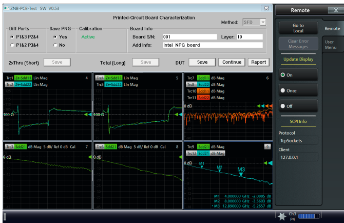
The steps of the test procedure