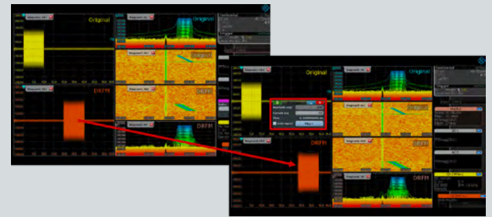
Figure 2: Analysis of retransmitted echo in relation to the original pulse with the R&S®RTP oscilloscope onboard-tools. Changes over time can be tracked in both time and frequency domain

One of the most prominent examples is the digital radio frequency memory (DRFM) jamming technique, where the jammer is capable of receiving the original radar signal and creating a fake radar echo representing a false target that the transmitting radar cannot distinguish from other legitimate signals. For this purpose, the retransmitted false targets have to maintain coherence with the original signal. This can only be validated when both the original and retransmitted pulses are analyzed in relation to each other. The R&S®RTP oscilloscope allows a phase-coherent analysis of both signals in time and frequency domains. With an internal analysis bandwidth up to 16 GHz, it even offers the RF hopper analysis for frequency-agile radars over a relatively wide bandwidth, to verify if the DRFM is following that agility.