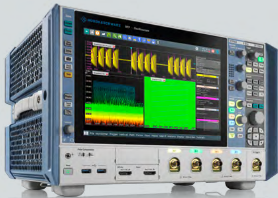
Figure 1: The R&S®RTP oscilloscope

Besides the characterization of multi-antenna designs, phase coherence has a crucial role when modulated pulsed signals have to be analyzed in relation to each other.