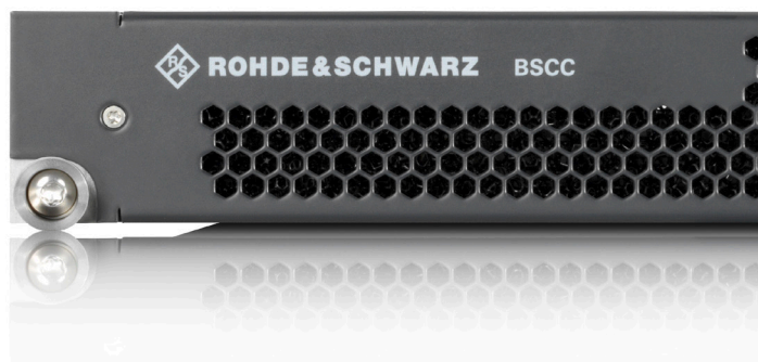
R&S®BSCC2.0 broadcast service and control center.

Running as part of the core network, the R&S®BSCC2.0 – including the broadcast multicast service center (BM-SC), multimedia broadcast/multicast service gateway (MBMS-GW) and a centralized multi-cell/multicast coordination entity (MCE) – is a software defined solution for delivering multimedia content over 4G/5G networks in broadcast and multicast mode. It encapsulates multimedia content into specific FeMBMS bearers to be delivered from the evolved packet core (EPC) down to the receiver. It allows network operators to roll out advanced FeMBMS services that mix different types of media over networks with hybrid unicast/broadcast coverage.