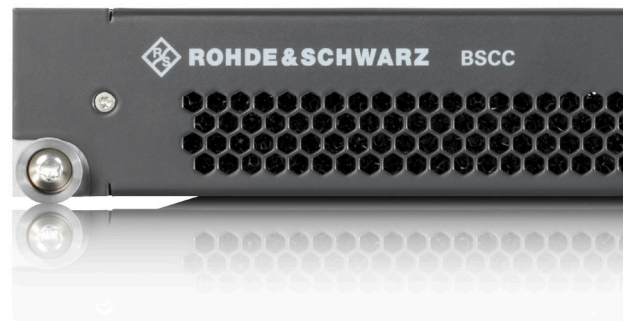
R&S®BSCC2.0 broadcast service and control center