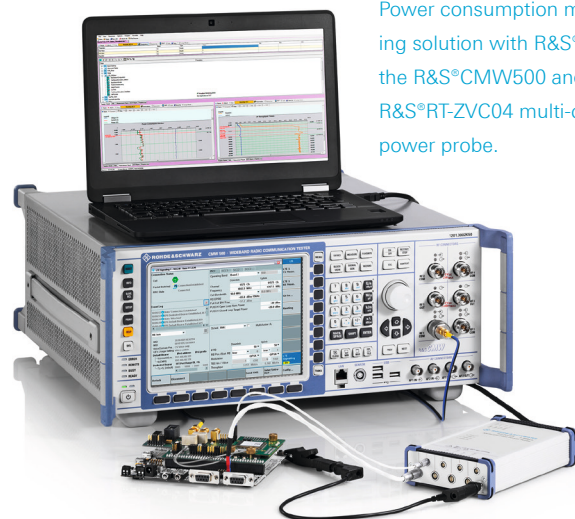
Power consumption monitoring solution with R&S®CMWrun, the R&S®CMW500 and the R&S®RT-ZVC04 multi-channel power probe.

Specific signaling trigger events (e.g. LTE attach, connected, idle signaling state or IMS registration) have been implemented, providing more details (i.e. more samples). These are displayed and time-correlated on the power consumption diagram. The power consumption diagram is also correlated to events at the IP level by using IP traffic analysis (R&S®CMW-KM051), which indicates which app or IP flow affects the battery lifetime of telematics units or other wireless devices.