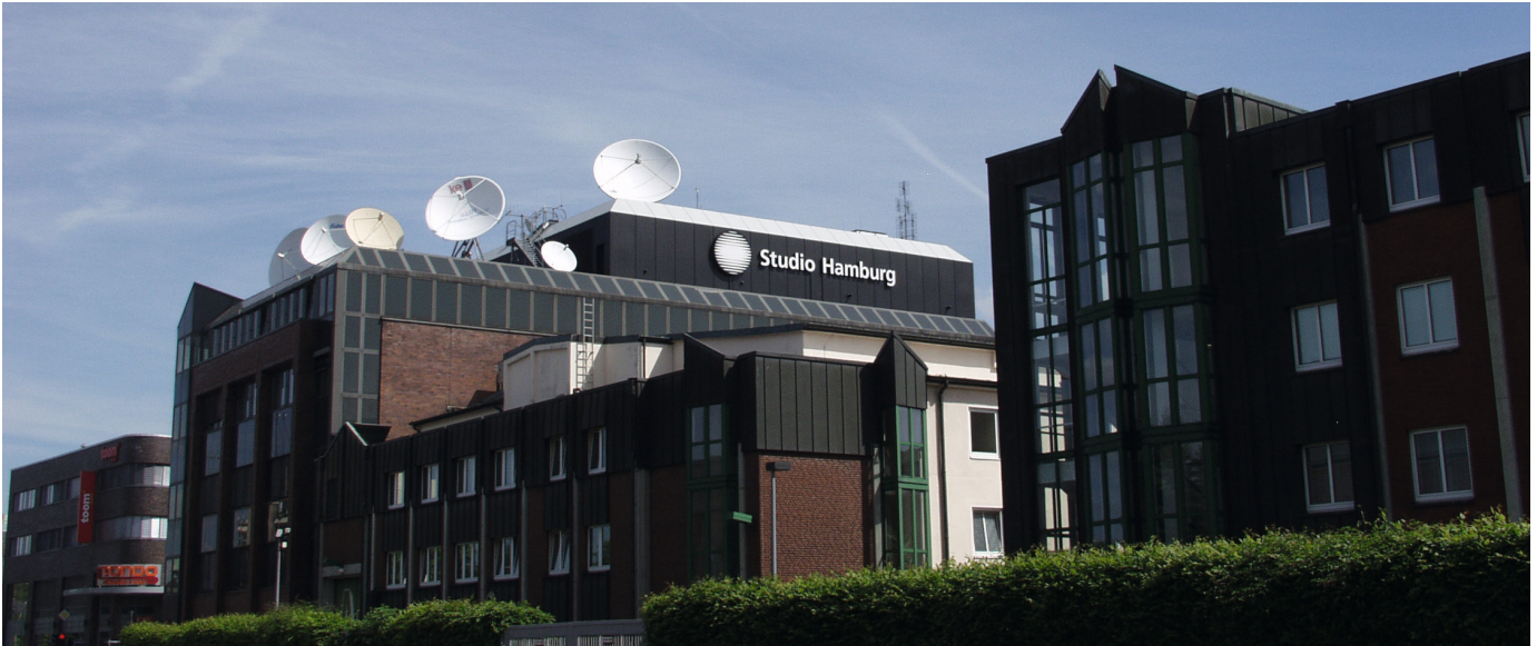
Studio Hamburg Postproduction is using R&S®CLIPSTER to digitize historical film material.