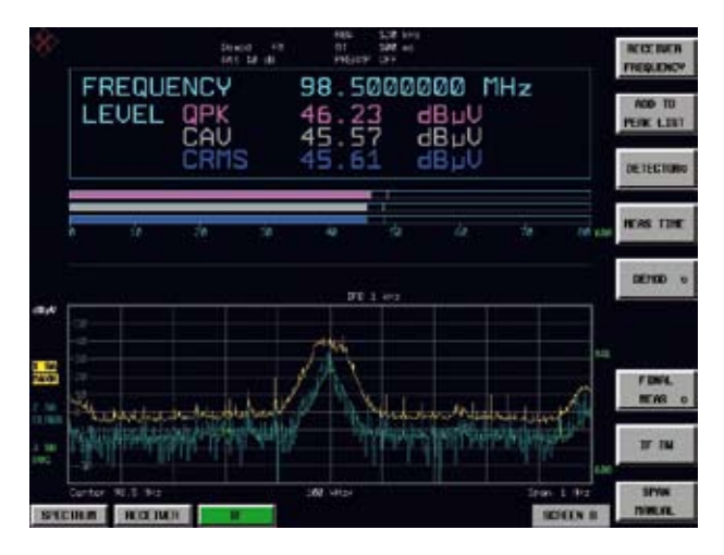
Receiver mode (frequency/level display, bargraph display and continuous realtime IF analysis for set center frequency)