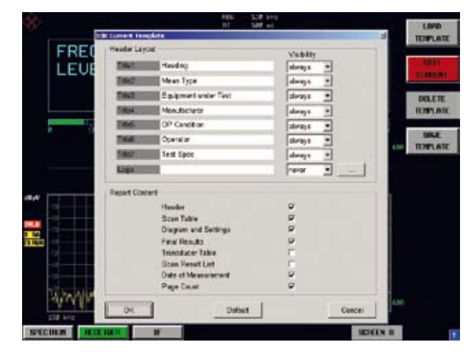
Template editor of report generator