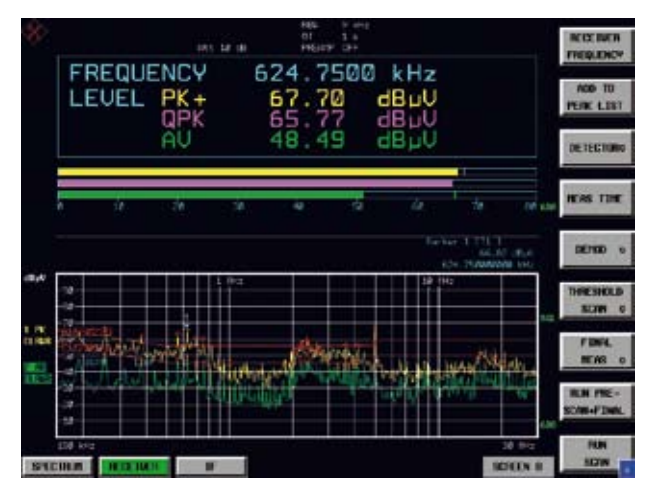
Receiver mode (spectrum display (scan) of preview measurement (PK+AV), limit lines and final measurement results with QP and AV evaluation)