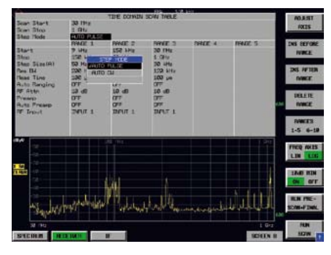
Fast time-domain scan (FFT) with scan table editor