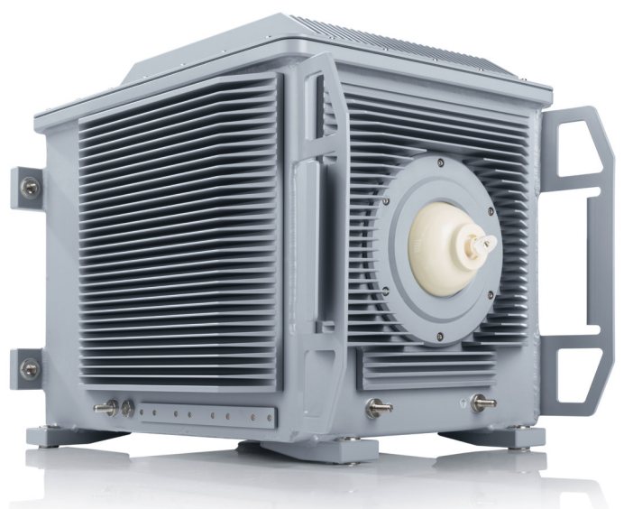
40 Rohde & Schwarz Antennas and Accessories | Catalog 2024/2025