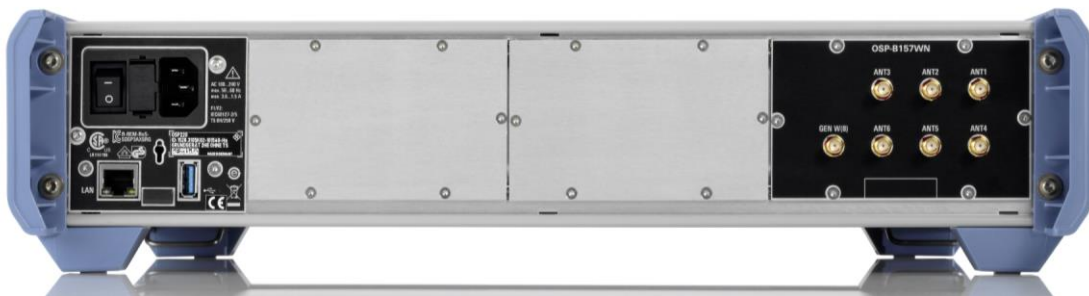
Rear view of the R&S®OSP-B157WN extension module integrated in the R&S®OSP220