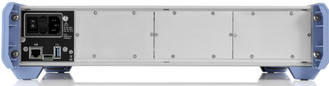
Rear view of the R&S®OSP-B157WX extension module integrated in the R&S®OSP220