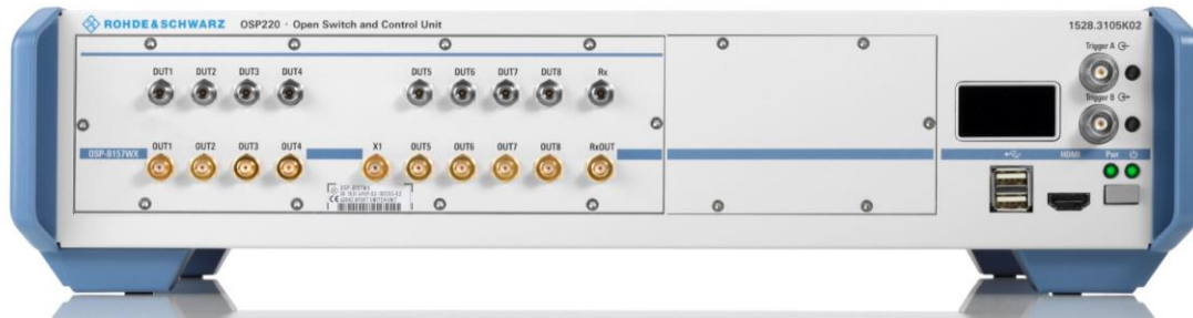
R&S®OSP220 with R&S®OSP-B157WX (front view)

R&S®OSP220 switch unit with integrated R&S®OSP-B157WX module