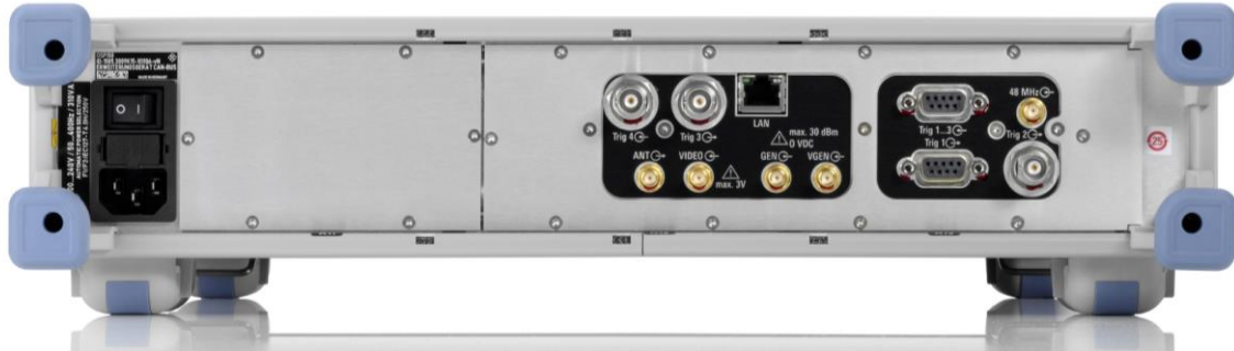
Rear view of the R&S®OSP-B157W8 PLUS basic module integrated in the R&S®OSP150