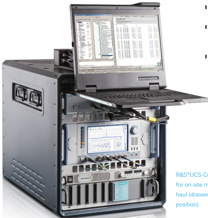
R&S®UCS-Compact radio test set for on-site maintenance and over-haul (drawer monitor in operation position).