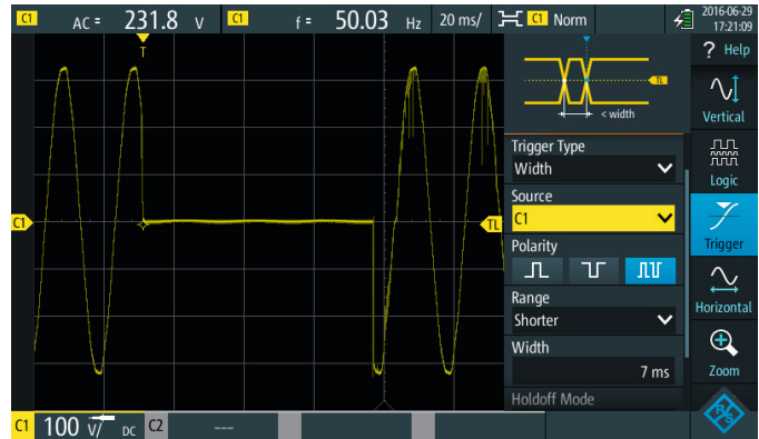
Dedicated trigger functions, for example the width trigger, allow to isolate unwanted events like supply voltage dips.

Voltage variations are efficiently monitored using the logger mode. Based on any set of up to four automatic oscilloscope measurements, results are automatically logged for up to 23 days. Hourly, daily or weekly variations in the voltage, frequency or any other relevant measurement can easily be uncovered.