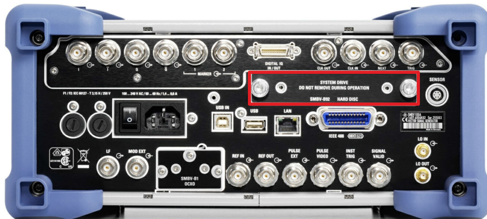
Figure 5-1: Location of the Hard Disk