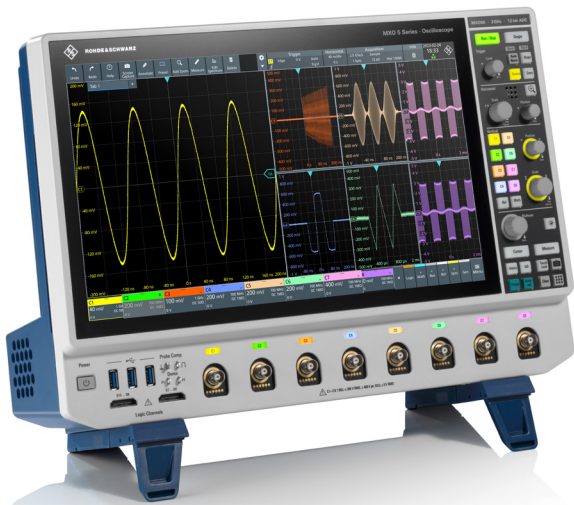
R&S®MXO 5 oscilloscope

Validating switching converter stability is vital for any power supply design. Frequency loop and load transient responses are often used to ensure switching converter stability. Even as frequency loop response becomes more important to design validation, load transient response is still commonly used. Load transient response can also be enhanced by visualizing the positive duty cycle for pulse width modulation (PWM) signals over time. A modern oscilloscope can do this, while also helping identify unknown converter effects.