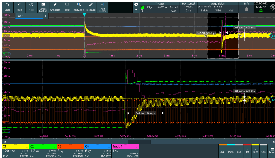
Figure 3: Load transient setup of a step-down converter

Reviewing control theory shows the 2% deviation comes from higher conduction losses caused by higher output current. The higher losses are mainly generated in the transformer and output rectifier. The additional losses need to be equalized by increasing the positive duty cycle and the track function allows this complex measurement task to be performed.