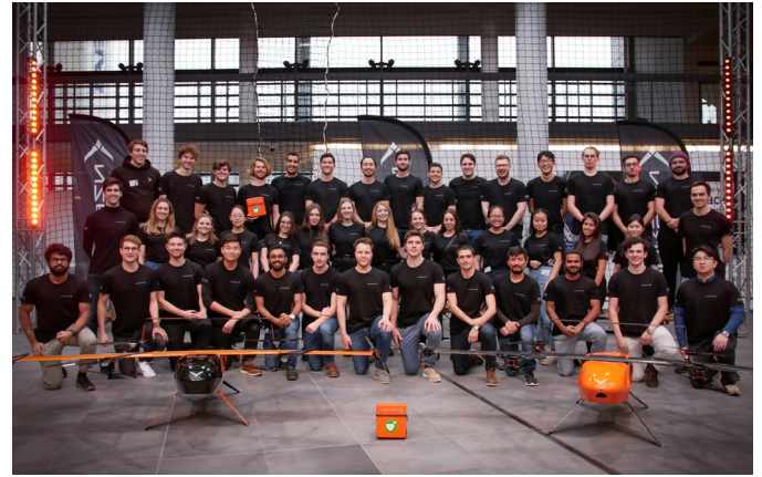
The HORYZN team after successful rollout of the "Frankenstein I" prototype in December 2021.

The R&S®Spectrum Rider FPH has a built-in GPS and compass for future triangulation experiments to determine interference and signal strengths. These features can be easily configured in the field. The spectrogram function helps visualize the measurement bandwidth and interpret the overall channel stability. Its clear, warm tones depict the power densities to allow intuitive analysis of different signals.