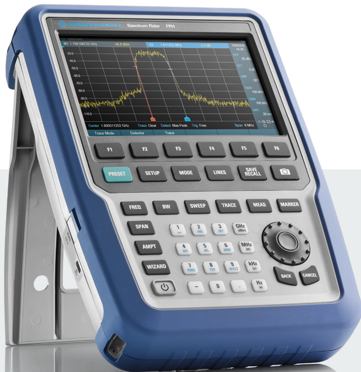
The R&S®Spectrum Rider FPH

Flight tests can be long in many cases, but the R&S®Spectrum Rider FPH has seven hours of battery life, which is entirely sufficient. The touchscreen makes it easy to zoom in and traverse through the spectrum, while