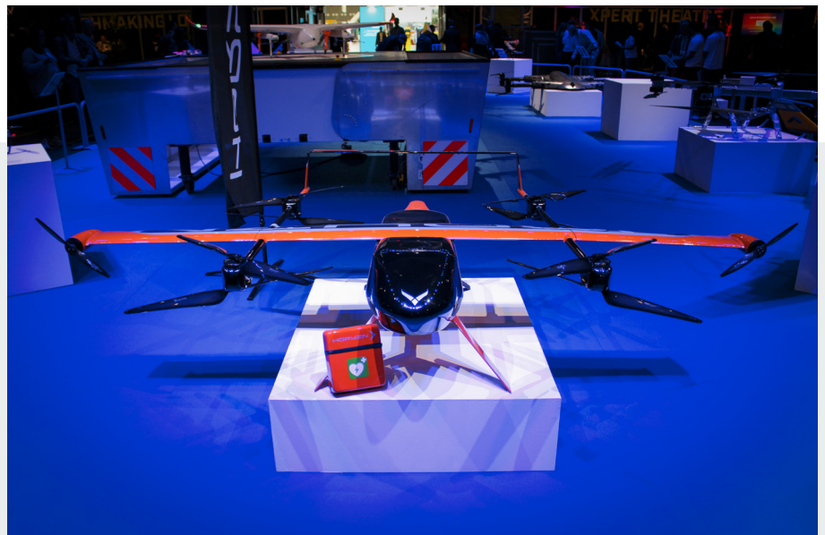
HORYZN's Mission Pulse "Frankenstein I" eVTOL test bench includes the R&S®Spectrum Rider FPH handheld spectrum analyzer to test EMI and signal strength.

The R&S®Spectrum Rider FPH gives HORYZN the confidence to carry out tests on even the smallest hardware parts, ensuring failsafe critical applications. In the future, HORYZN wants to develop most of its dedicated hardware in-house. Information about the various communications channels can be very helpful in the process of designing the communications modules and ensuring the necessary reliability.