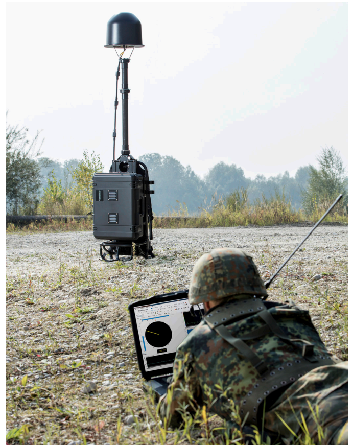
Semi-mobile operation with a laptop

Stationary system operation is possible when a certain area must be monitored for a defined period of time. The carrying frame is placed on the ground and fixed with guy ropes. The carbon mast extension increases the antenna height to about 1.8 m without a separate tripod. In stationary operation, the operating computer is a ruggedized laptop with control software modules. The high performance laptop can run additional software, such as a digital signal analysis program.