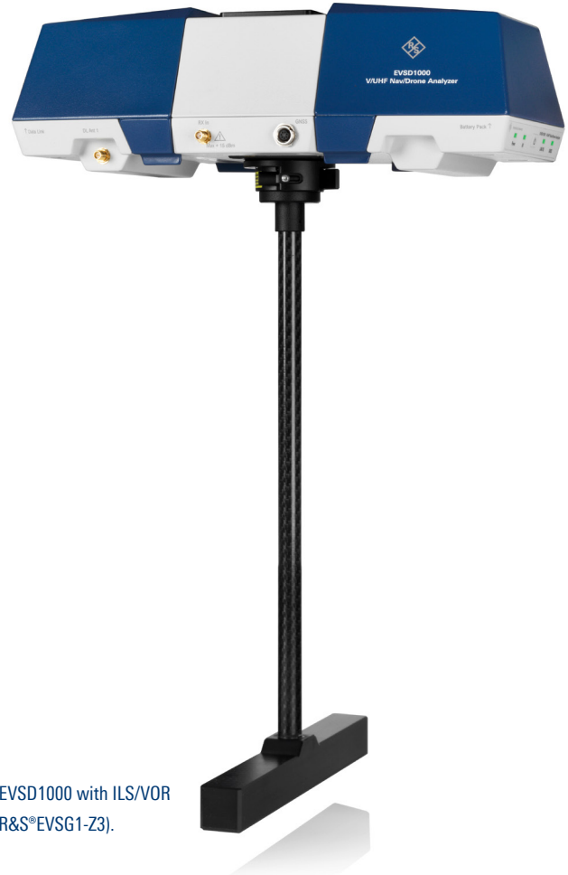
The R&S®EVSD1000 with ILS/VOR antenna (R&S®EVSG1-Z3).

R&S®EVSG1-Z11 verification test software lets users independently perform verifications. The software is run on an external PC and performs all the necessary and time-consuming measurements and automatically generates test reports.