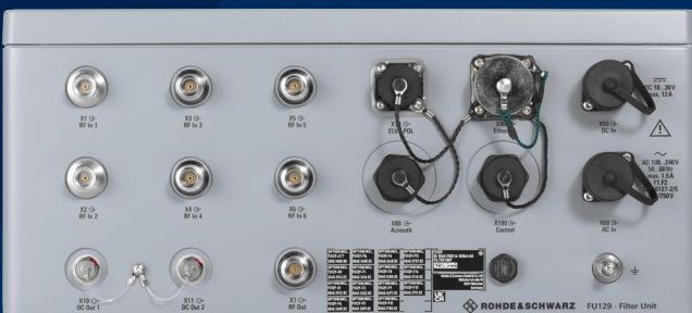
N version (model .14).