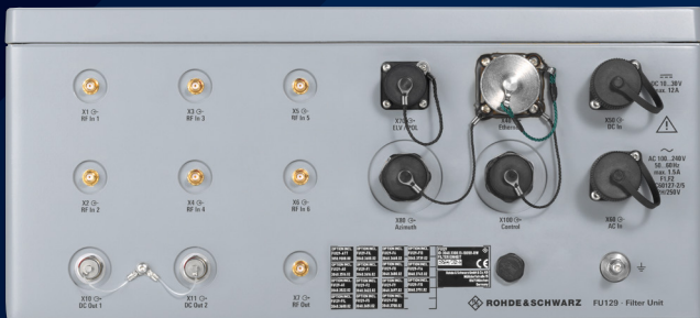
SMA version (model .13).