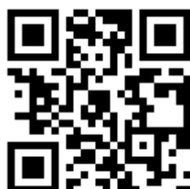
Figure 4-1: QR code to the Rohde & Schwarz support page

Contact our customer support center at www.rohde-schwarz.com/support , or follow this QR code: