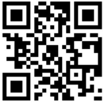
Figure 3-1: QR code to the Rohde & Schwarz support page