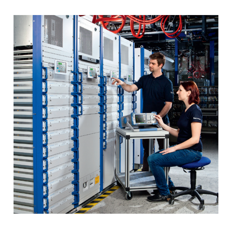
The R&S®THR9 transmitter

Rohde & Schwarz has been a privately owned company for more than 80 years, and more than 10,500 employees worldwide. Our first FM transmitter, the first FM transmitter in Germany, went on the air in 1949. We are among the technology and market leaders in a number of business fields, and with more than 3,000 highly trained manufacturing experts, we have complete control over product quality and capacity. Rohde & Schwarz has built our reputation on exacting standards and excellent customer service, and with more than 500 employees on our North American team, we'll be here to provide all the support you need for as long as you'll need it.