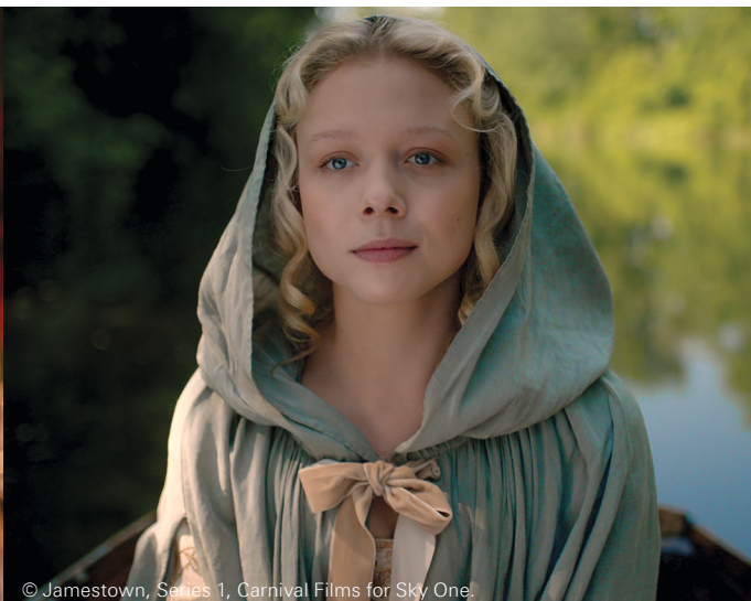
© Jamestown, Series 1, Carnival Films for Sky One.

Scenes from two films that The Farm Group helped to make. The Farm Group relies on products from Rohde&Schwarz.